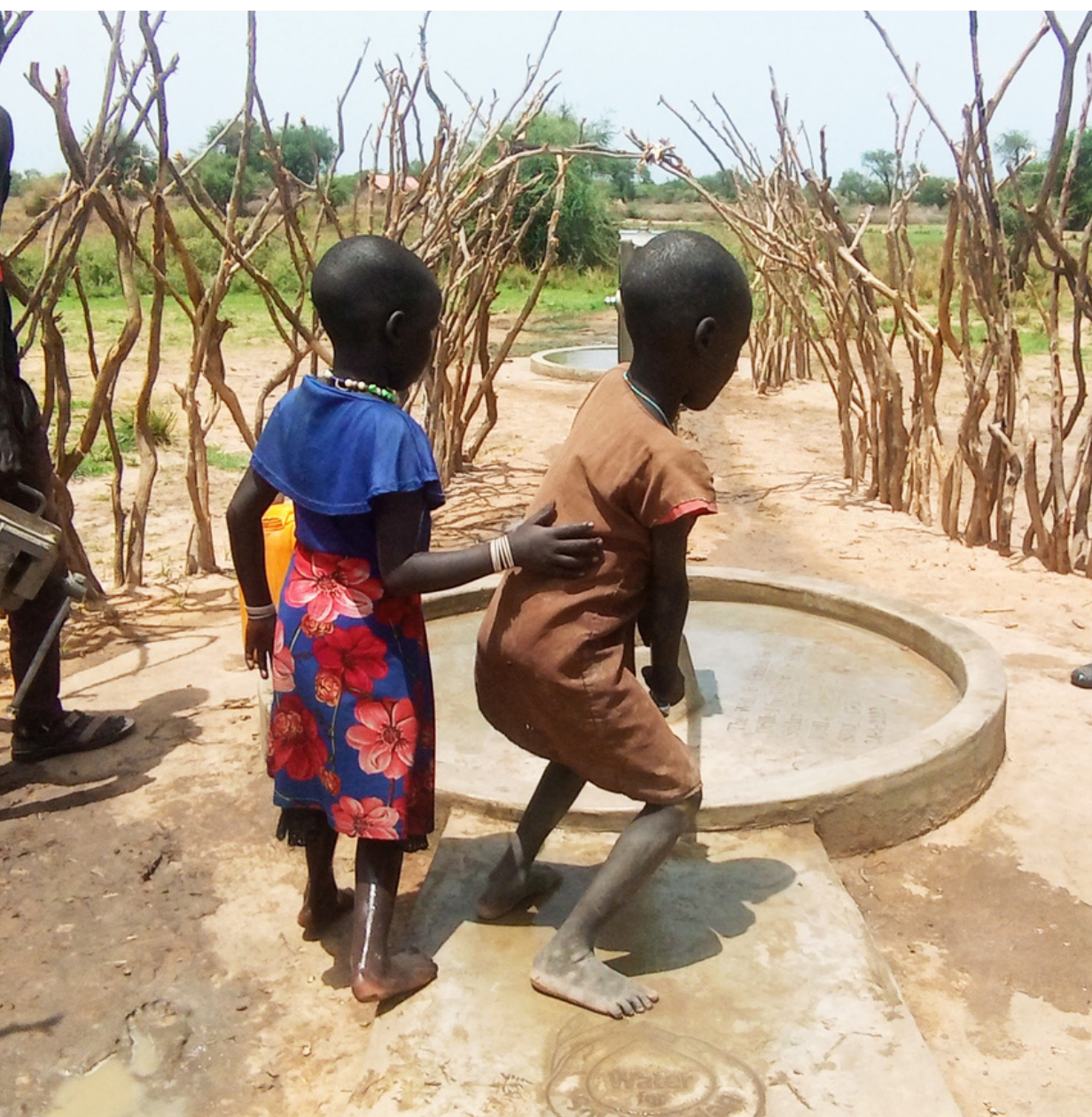
New well in Jarweng village