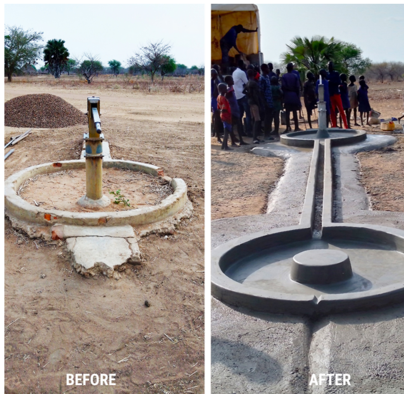
Rehabilitated well at Panmil primary school