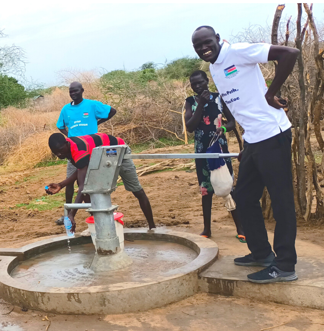
New well in Ayidit village