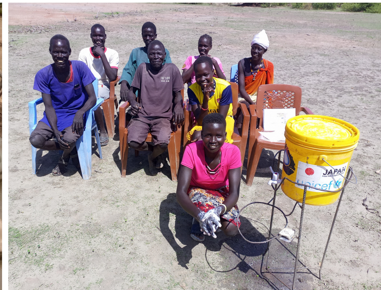
Angobic village hygiene training

empowering educators with safe practices to share with their communities