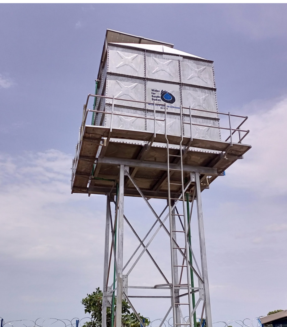
Tower distributes piped water to five kiosks

providing new daily access to water to 2,000 people in Piantok village