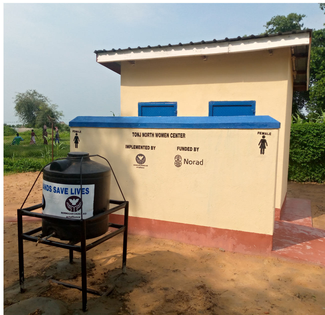
Latrine constructed at Tonj North Women Center