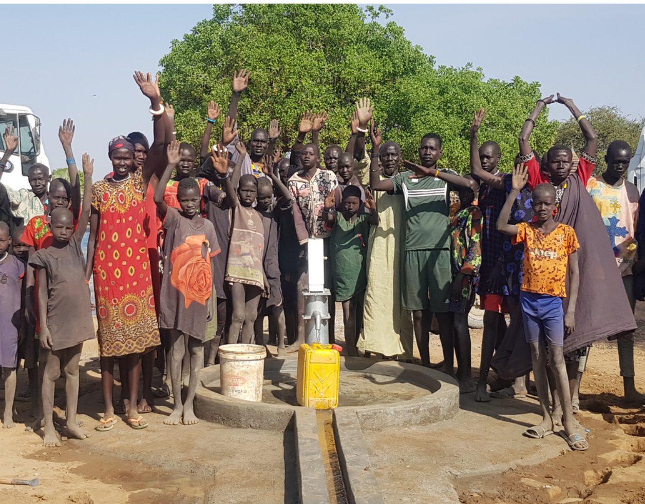
Palam village newly drilled well

providing new daily access to water to 28,451 people