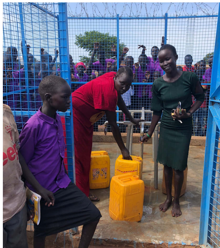
Community center kiosk