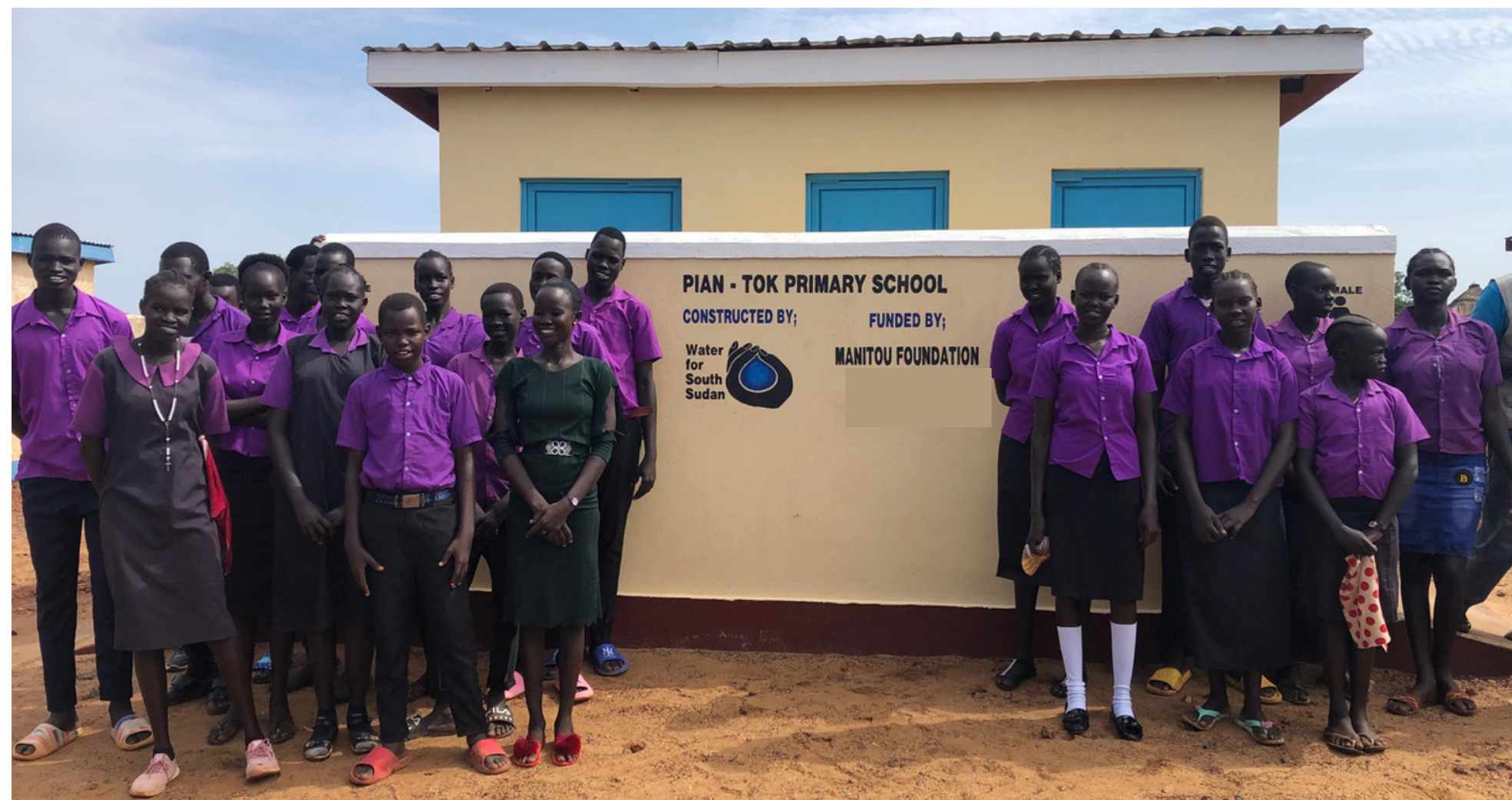
Piantok Primary school toilet facility

providing new toilet access to 521 students