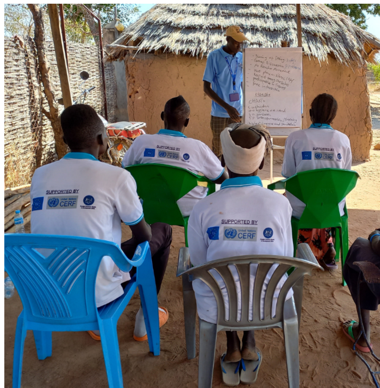
Adukthik primary school hygiene education training session

17 broken wells rehabilitated at schools and health facilities