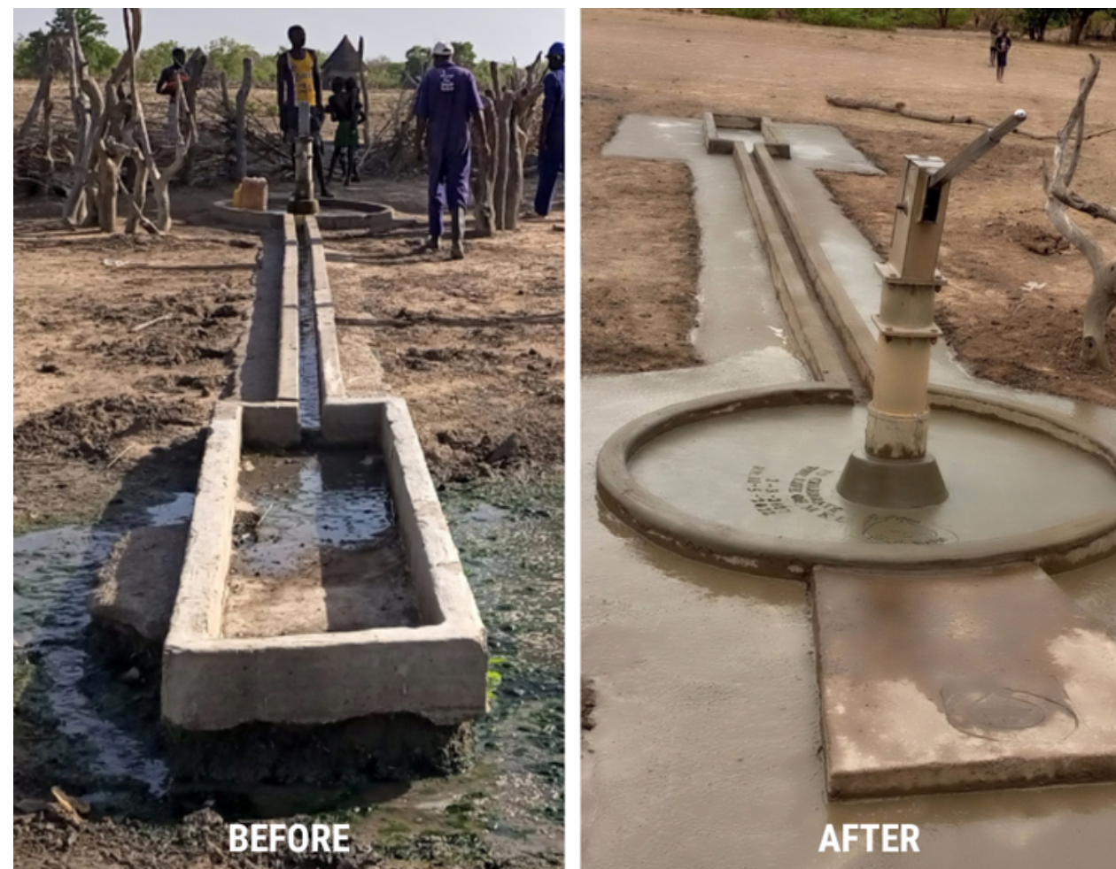
Akoc-Chok village well rehabilitation

providing renewed daily access to water to 35,475 people